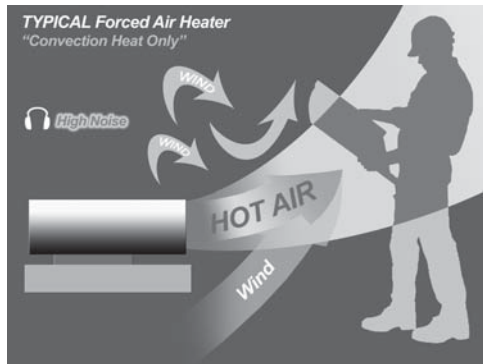
Typical Forced Air Heater